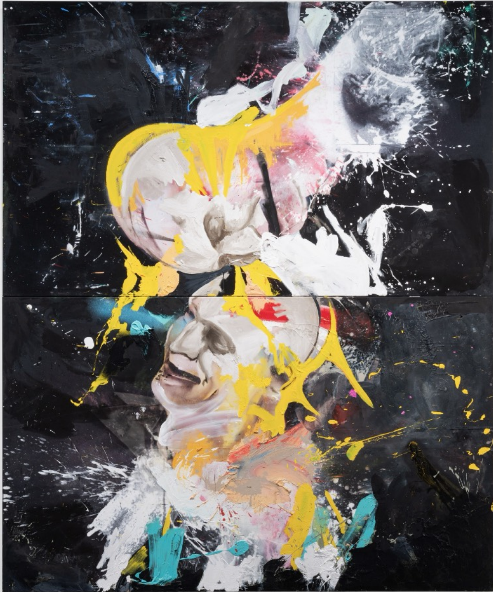
Achilles coming to terms with his mortality 2022/23, Oil, spray, acrylic on printed polyester, 300 x 250 cm

Courtesy of the artist and Stallmann Galleries. Installation view, Chronorama Redux at Palazzo Grassi, 2023. Ph. Marco Cappelletti © Palazzo Grassi