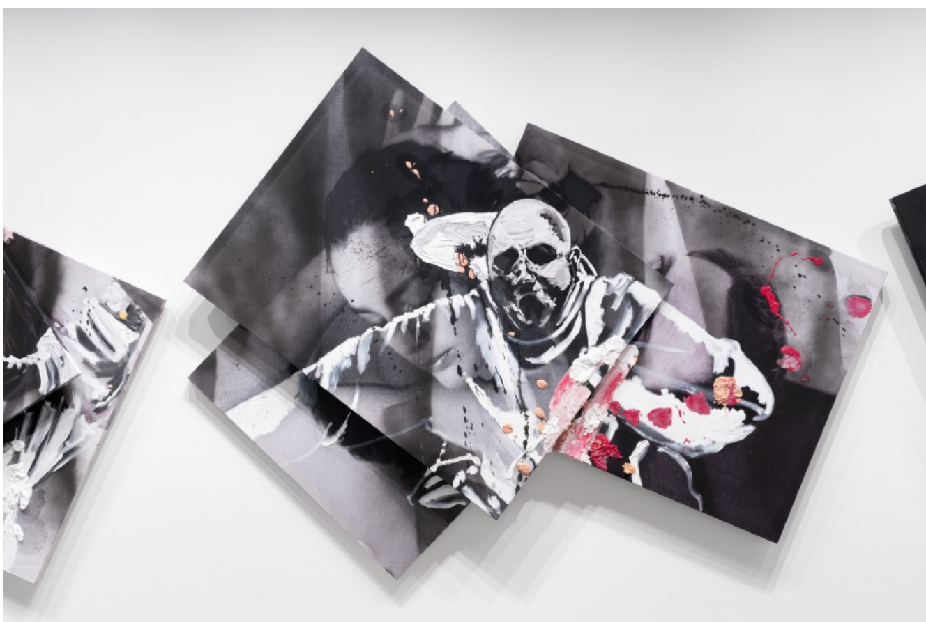
I THINK OF HOW ALL THINGS DIE (YAWN) 2023, Oil on printed fabric , 350 x 300 cm

Installation view, Chronorama Redux at Palazzo Grassi, 2023.