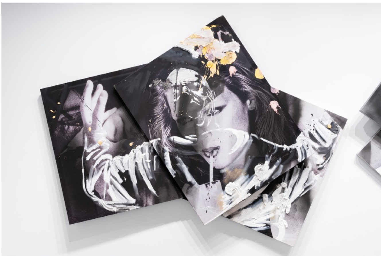
I THINK ABOUT VANITY OF ALL THINGS (YAWN) 2023, Oil on printed fabric , 350 x 300 cm

Installation view, Chronorama Redux at Palazzo Grassi, 2023.