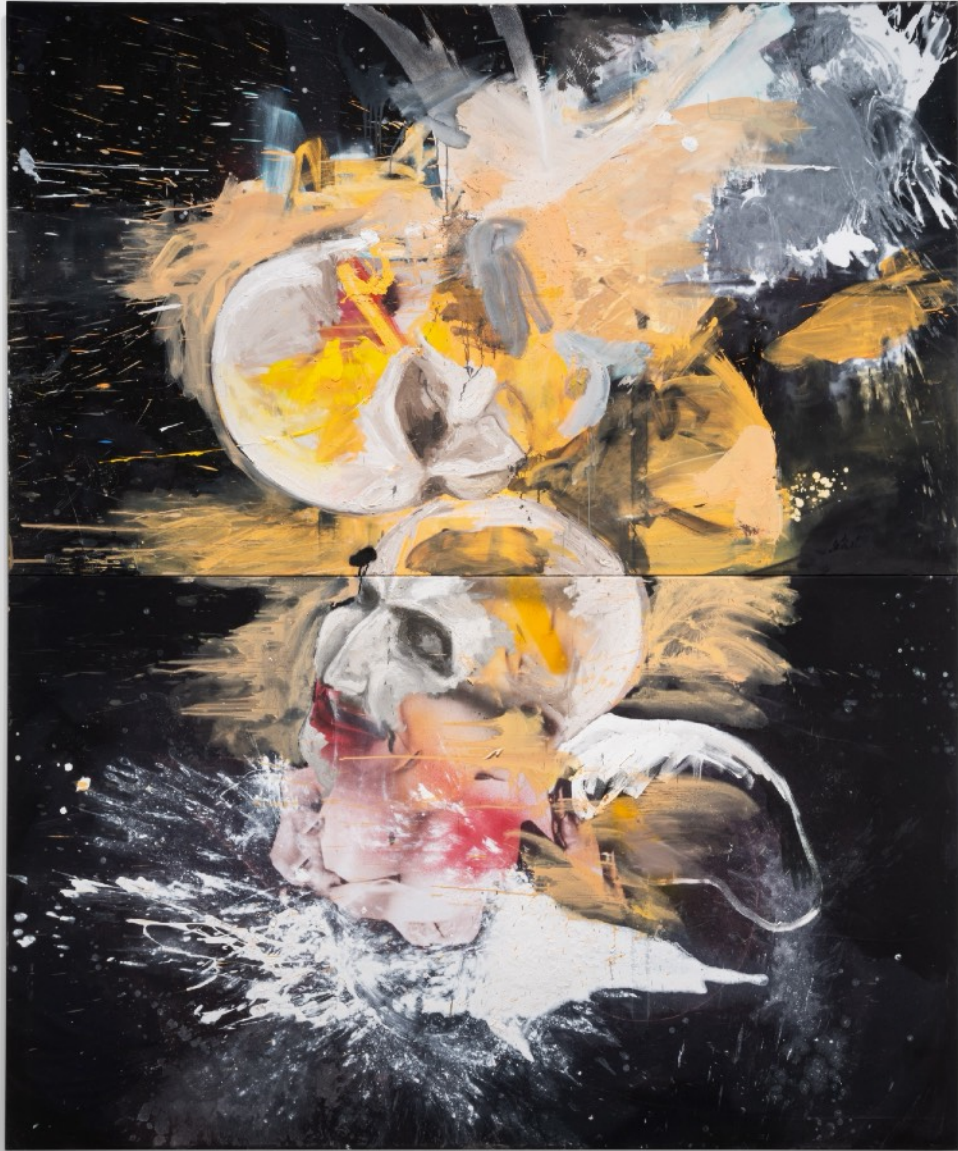
Narcissus. Three seconds before you realize you're full of shit 2022/23, Oil, spray, acrylic on printed polyester, 300 x 250 cm

Installation view, Chronorama Redux at Palazzo Grassi, 2023.