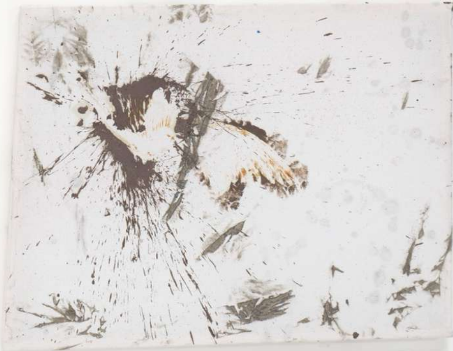
Two of us in the room; one of us must leave, 2024, Oil on found cloth, 61 x 78 / 58 x 76.5 cm